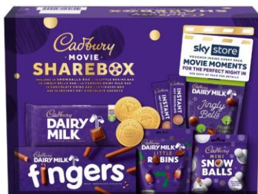
Cadbury Movie Sharebox x 2, 8 for £12

This is a great little comic which tells the Christmas story and has a colouring at the back.