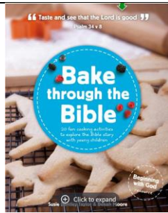
Bake through the Bible x 9 £4.30 each

This is a great book that tells stories of Jesus & encourages families to bake something to remind them about the story.