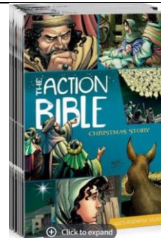
Action Bible Christmas Story Comic Pack – Set of 25 for £22.84

This is a great book that tells stories of Jesus & encourages families to bake something to remind them about the story.